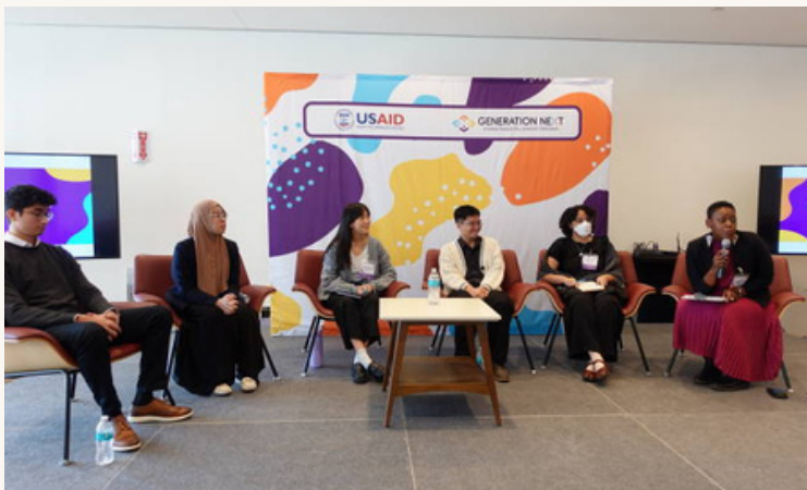
Fellows answer audience questions during the "Voices of GenNext Fellows" panel.

On Thursday, October 17, 2024, at the Martin Luther King, Jr. Memorial Library in Washington, DC, the Generation Next Humanitarian Fellowship Program (GenNext) hosted its very first GenNext Symposium. GenNext, a program of the Public Health Institute (PHI), supported by the U.S. Agency for International Development (USAID), aims to increase the diversity of professionals in the Humanitarian sector by building a pathway for students from Minority-Serving Institutions (MSIs).