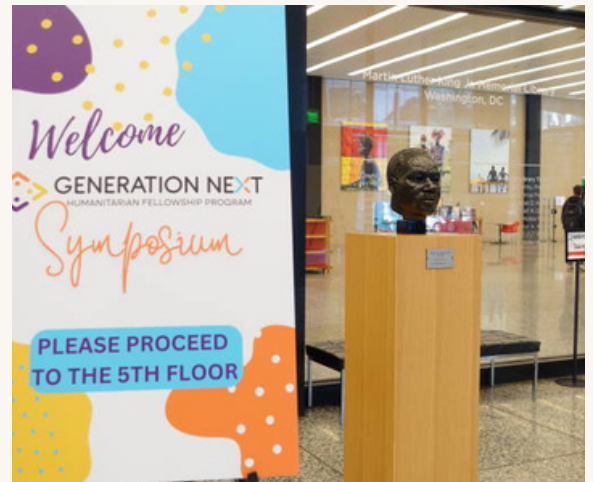
MLK, Jr. Memorial Library in DC served as Symposium venue